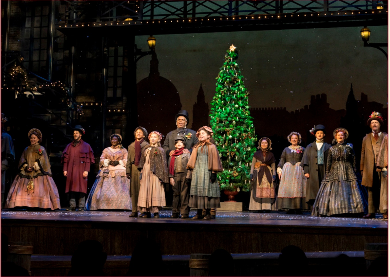
Photo of the Company of A Christmas Carol

The play A Christmas Carol is based on the novel by Charles Dickens. The play tells a story with actors talking, singing and dancing on the stage.