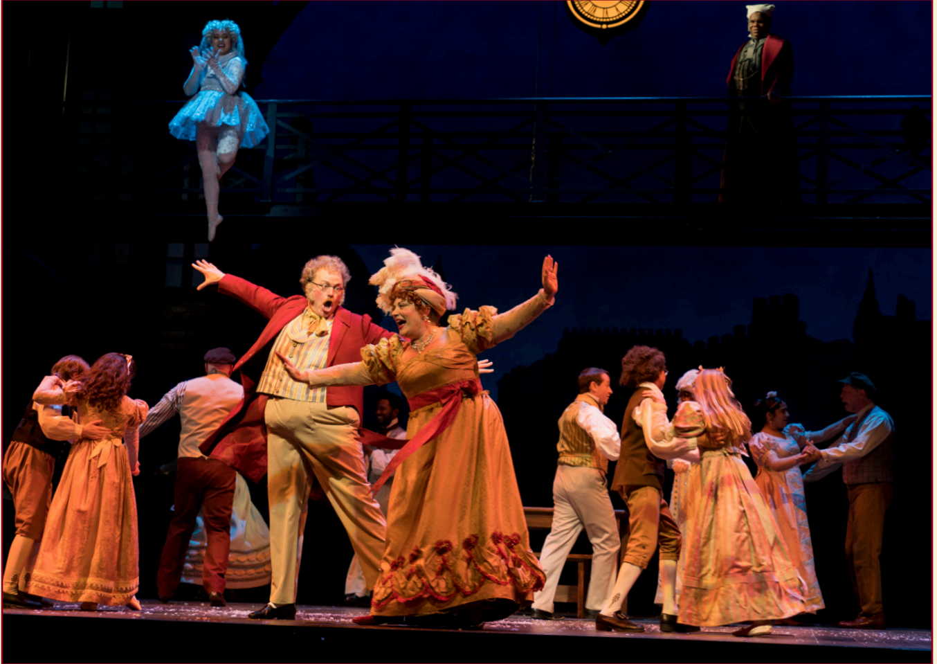
Photo of the Company of A Christmas Carol.

There will be recorded music playing throughout the show.