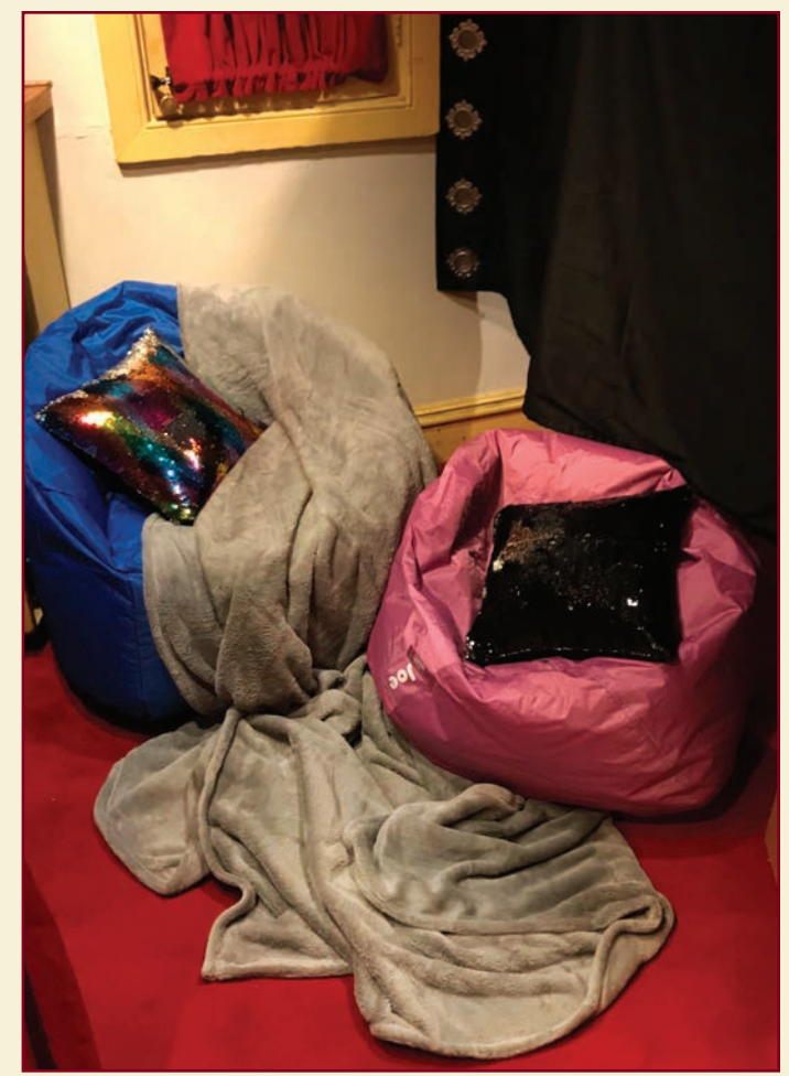
reak space: Balcony level. Photo by Allison Alonzy. Sample break space: Orchestra level. Photo by Allison Alonzy.

If I need to take a break during the show, I can go to a Take-a-Break space.