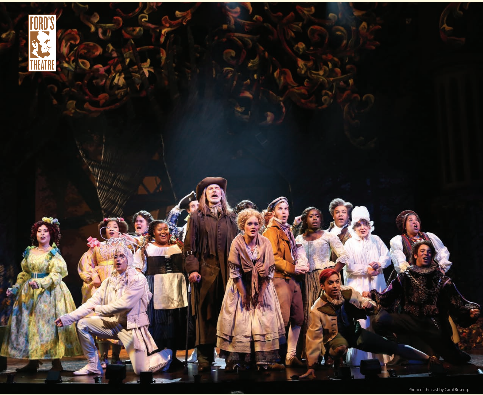
Photo of the cast