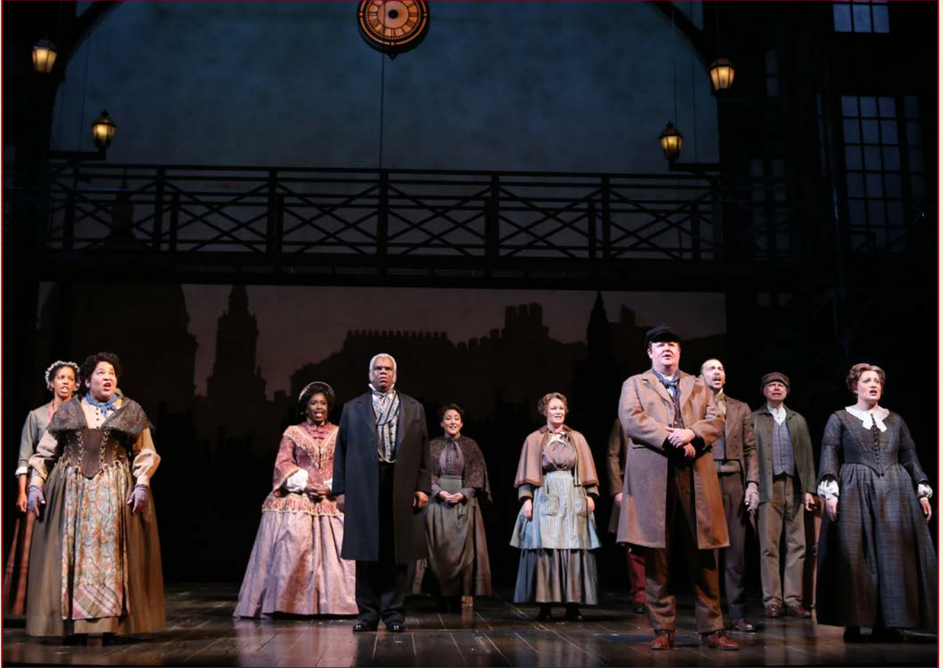
Photo of the cast

A show is a story that is told by people on the stage.