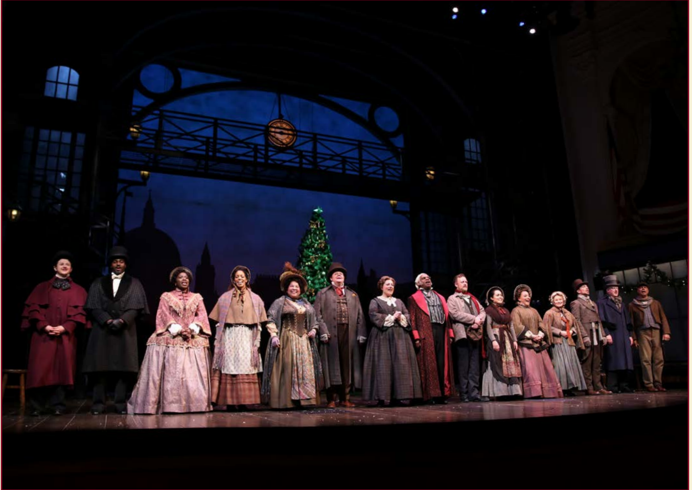
Photo of the cast

When the show is over, all of the actors will come on stage and bow.