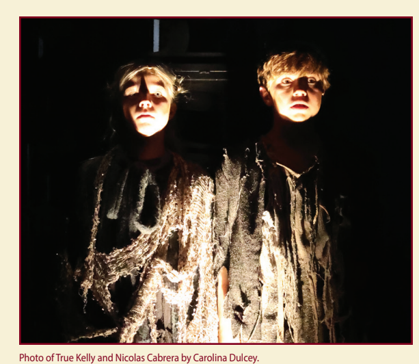
IGNORANCE AND WANT

Two children who represent the worst of humanity. Ignorance represents not knowing or caring about other people around you. Want represents the poor, the hungry and the suffering people in the world. The Ghost of Christmas Present shows them to Scrooge.