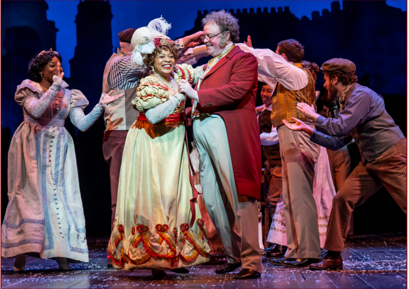
Photo of the company of A Christmas Carol.

There will be recorded music playing throughout the show.