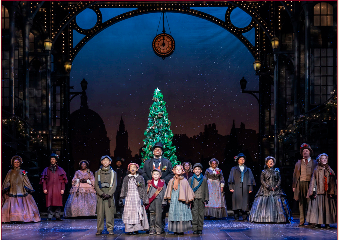
Photo of the company of A Christmas Carol.

The play A Christmas Carol is based on the novel by Charles Dickens. The play tells a story with actors talking, singing and dancing on the stage.