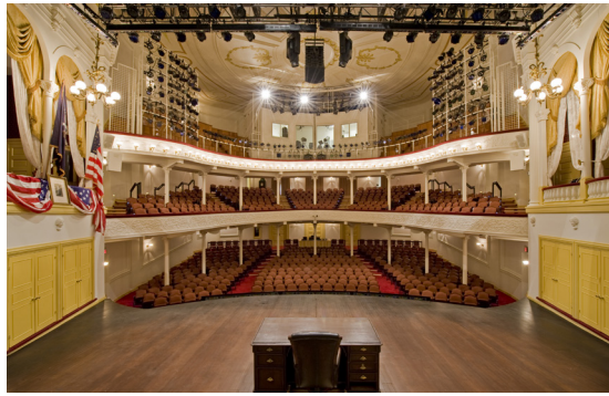
View from the stage of the President's Box at Ford's Theatre.

historic site visitors welcomed to Ford's Theatre.