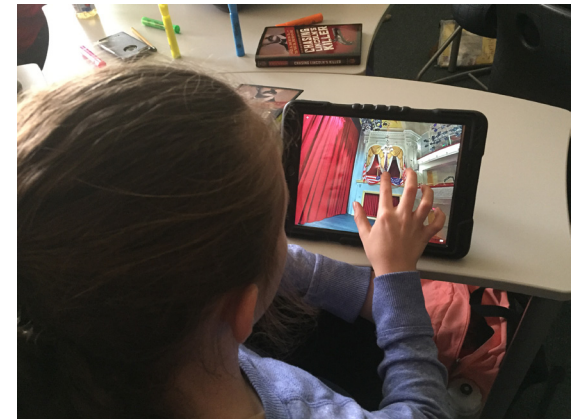
A student explores the Presidential Box in a virtual tour of Ford's Theatre on an iPad.

learners participated in our virtual history workshops.