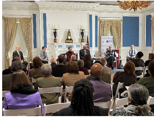
L: President Abraham Lincoln. R: Hon. Sharon Pratt and Michael Steele.

WASHINGTON, D.C. – On Tuesday, May 21, 2024, at 7-9 p.m., Ford's Theatre Society and the Institute for Politics Policy and History will host IPPH Founding Director, former Mayor Hon. Sharon Pratt , and MSNBC Co-Host, The Weekend and IPPH Board Co-Chair Michael Steele on the historic Ford's Theatre stage, as they lead an illuminating panel discussion with respected historians, accompanied by a dramatic reflection of President Abraham Lincoln's journey.