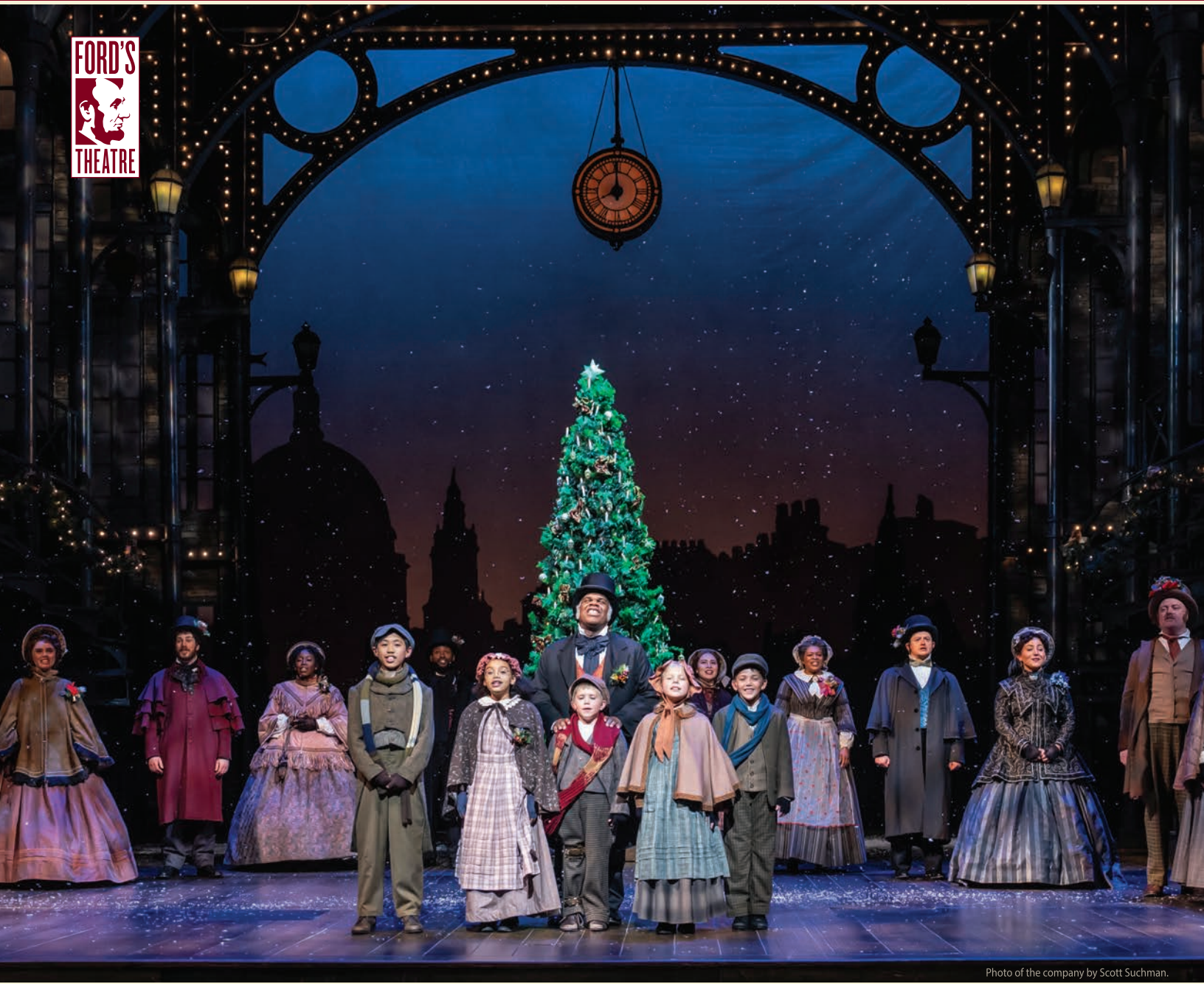
Photo of the company