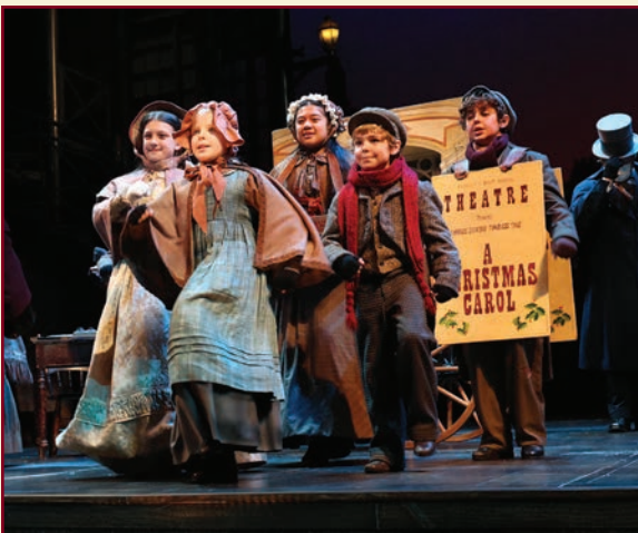
Photo of the young company

Each of these people are trying to sell goods to the people of London—antique dolls, fruits and nuts for a feast, or new inventions and technology. They each owe Scrooge a lot of money. Instead of repaying him on Christmas Eve, they each give him one of their goods—a special doll, a jug of cider and a steam-powered clock.