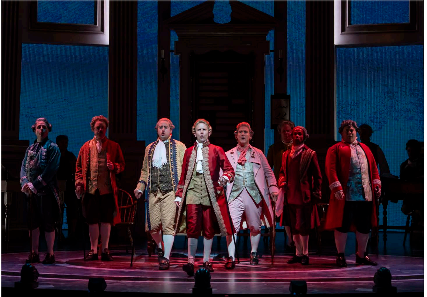
The cast of the 2026 Ford's Theatre production of 1776.

A show is a story that is told by people on the stage. The people in the play are called actors. The actors pretend to be characters during the show. The actors will sing to help tell the story.