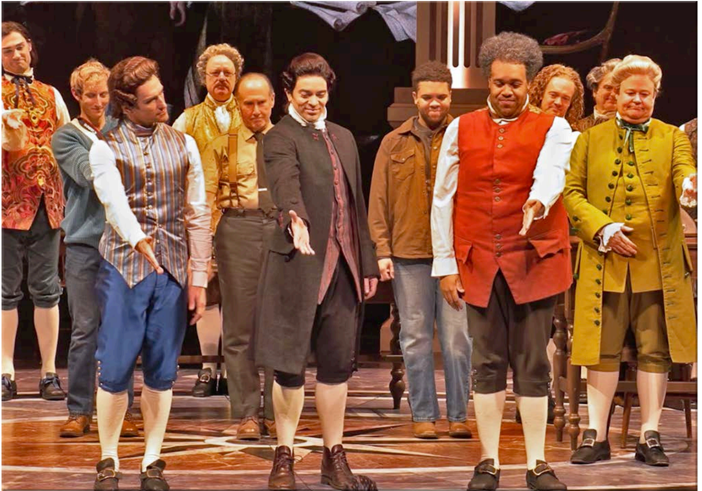
The cast of the 2026 Ford's Theatre production of 1776.

When the show is over, all of the actors will come on stage and bow.